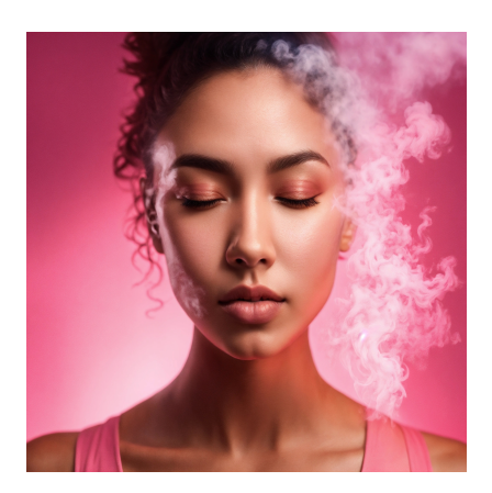
The Strange Smells of Mediumship