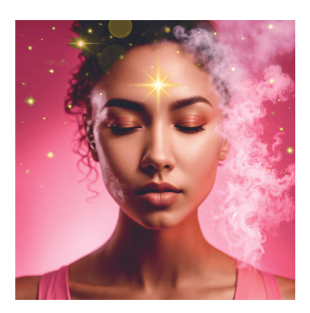
The Strange Smells of Mediumship