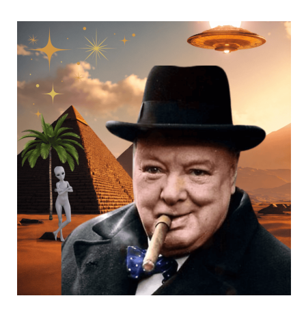
Winston Churchill Shines a Light