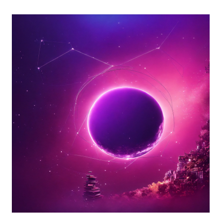
The Big Reveal, Eclipse Season Is Here